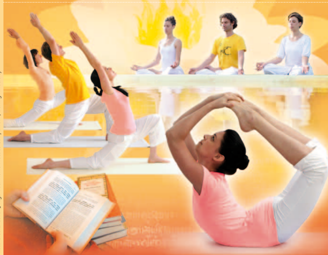
Photo Credits Cover "Yoga Your Home Practice Companion", Dotling Kindersley