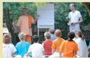
Texts: ©See above. The texts and photos contained herein are protected by copyright. Their use is prohibited without the express written permission of the copyright holders. Copyright violations will be prosecuted in accordance with the applicable laws.

Attendance at all activities is mandatory. Changes in the programme may occur from time to time. One day a week is given for personal activities and study. On this day students are required to attend morning and evening satsangs as well as to complete their Karma Yoga.